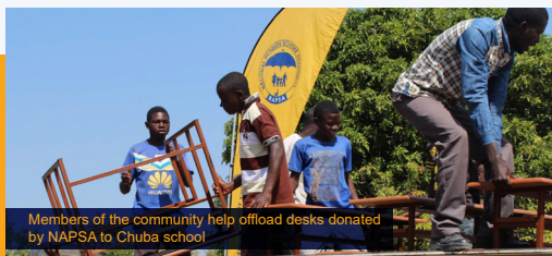
Members of the community help offload desks donated by NAPSA to Chuba school.

NAPSA believes that education plays an important role in the development of the nation. The Authority takes deliberate steps to support the education sector in form of infrastructure upgrades, donation of teaching and learning materials, classroom furniture and provision of internship opportunities for youths.