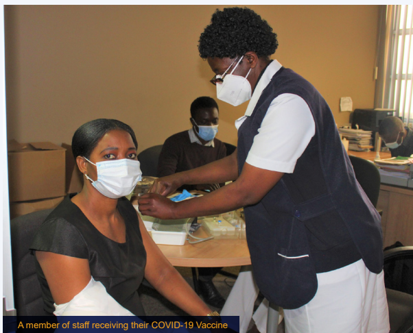
A member of staff receiving their COVID-19 Vaccine

Employees and members of the community receive free care, treatment and support from the Authority that ensures that those that are infected are taken care of and assisted to live positively.