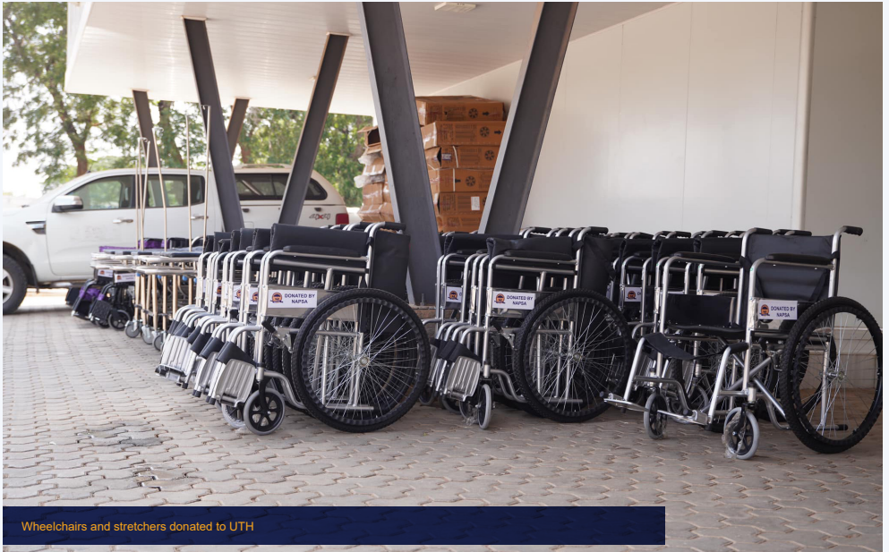
Wheelchairs and stretchers donated to UTH

The Authority's CSR investment covers areas such as Education, Health, Environmental Sustainability, Entrepreneurship, Community Welfare and Arts & Sports.